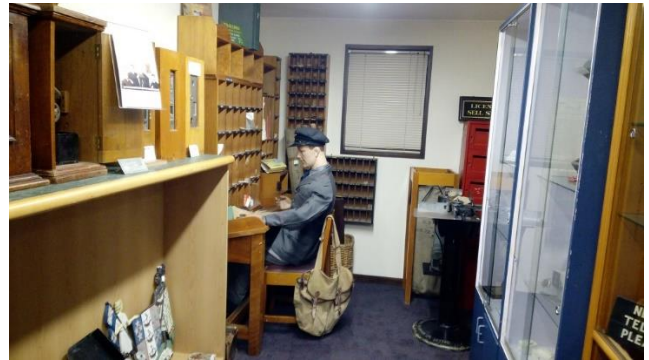
Authentic Postman's set up 1960s – on the left is a 1900s Dickie Machine opened