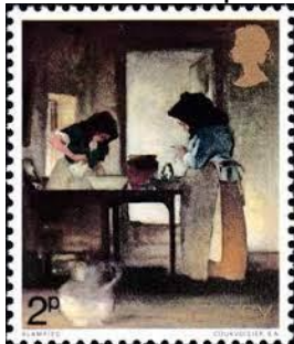
1971 Jersey Paintings

manure, a long-standing island practice. Blampied was invited to submit a design. The selection panel considered other artists' work superior to Blampied's but his was chosen for the 2½d stamp as it was more authentic. Blampied's "Tante Elizabeth" features on two later stamps but it can be seen that the two paintings are different.