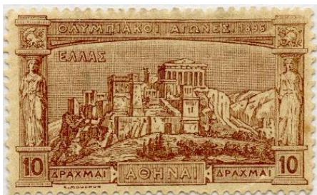
Greece 1896 10 drachma Olympic issue