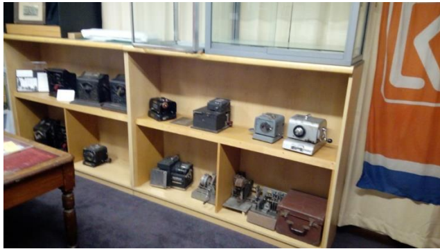
Graham's franking machines

The Museum was 3 of 4 rooms, with authentic, flags, designs, letterbox panels, Post Office savings bank piggy banks, metal plates, and a giant photo showing the staff of Christchurch Central Post Office in 1891! Also stamp vending machines, flags from various eras of the Post Office, promotional materials, corporate guides and official signs, coats of arms. It is a testament to the history of Post Offices in New Zealand.