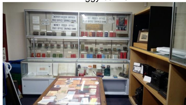
More savings banks through time, Franking machines and "Paperalia"