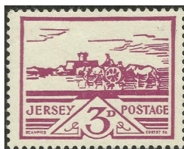
1943 Occupation Issue