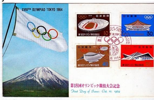
First Day Cover 1964 Tokyo Olympic