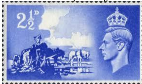
Blampied's Liberation stamp