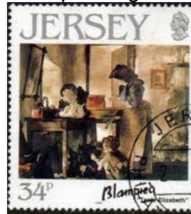
1986 Centenary of Blampied's Birth