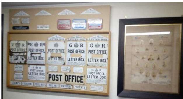
Post office panels from Victorian times to modern and the 1891 Corporate of Chch!