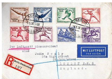
First Day Cover 1936 Berlin Olympics