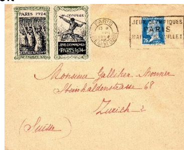
Paris 1924 cover with Olympic cancellation and tied poster stamps