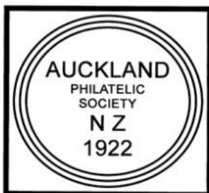
Auckland Philatelic Society

Meetings are held at the Mt. Albert Senior Citizens' Hall, Wairere Avenue on the first and third Tuesdays of each month except Jan starting at 7.45pm