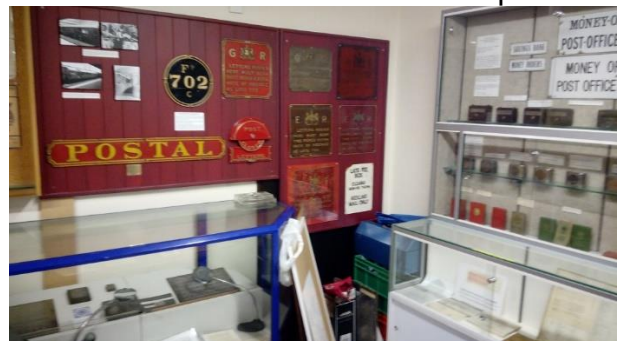
The Travelling Post Offices and the POSB Piggy banks