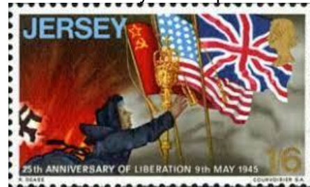
1970 25 th Anniversary of Liberation