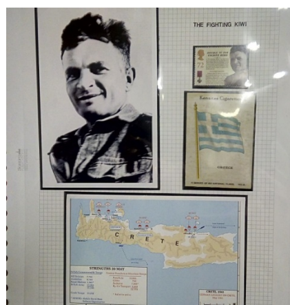
Upham and the site of his first VC