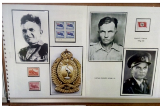
Before and after Colditz