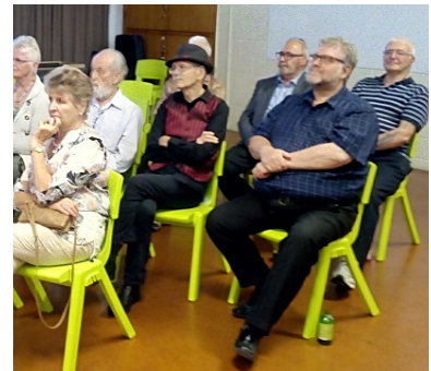
Watching the show

And again, a massive thanks to all the committee members, and everyone else who works hard in the setting up of the meeting, organising, food, raffles entertainment and ensuring everyone has a good time at these meetings – they cannot be so great without you!