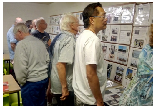
People loved this exhibit