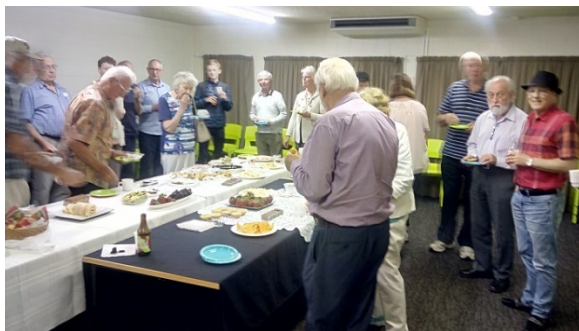
Digging in, while the editor goes off to get another prize

After the formalities, we had our supper, which was a large combined meal mostly of Yuletide delights and a lot of candy, chippies, soft drinks, devilled eggs and club sandwiches. A raffle was run with some nice prizes which included Philatelic and non-philatelic. Members could buy up to 10 tickets and the size of this raffle (Some 300 tickets sold) and number of prizes saw winning on almost bizarre levels with the editor winning no less than 7 times, others also won numerous times. If you buy 10 tickets in a raffle with 40 prizes on offer, you will probably win something and then something else too!