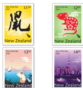
Year of the Rat

More of the same from New Zealand post over Summer 2019/2020. The main difference being the Chinese new year set has been moved back to December from January.