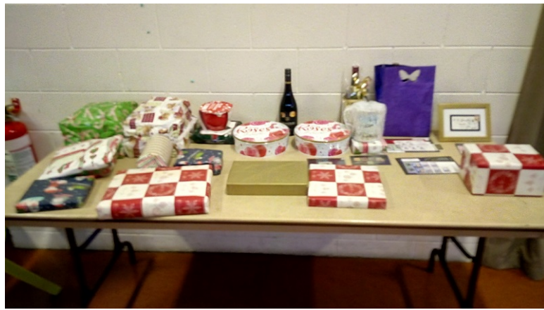
The Prizes on offer for the Big Raffle (A selection of stamps as well)

After the formalities, we had our supper, which was a large combined meal mostly of Yuletide delights and a lot of candy, chippies, soft drinks, devilled eggs and club sandwiches. A raffle was run with some nice prizes which included Philatelic and non-philatelic. Members could buy up to 10 tickets and the size of this raffle (Some 300 tickets sold) and number of prizes saw winning on almost bizarre levels with the editor winning no less than 7 times, others also won numerous times. If you buy 10 tickets in a raffle with 40 prizes on offer, you will probably win something and then something else too!