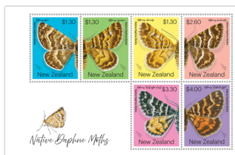
New Zealand moths

December – Year of the Rat , Rushing it out early for more of the same dated 2000s era graphics. The fad of Chinese new year is so 1990s and wearing thin. This set is pretty weak and really is not worth getting at all. Usual mini sheets and gold foil things for the Chinese community – D-