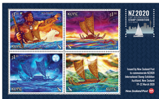
NZ2020 – Kupe