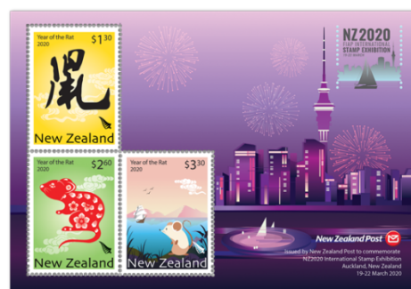
NZ2020 - Year of Rat