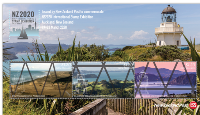
NZ2020 – Lighthouses