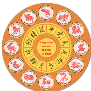
12 Year wheel thing