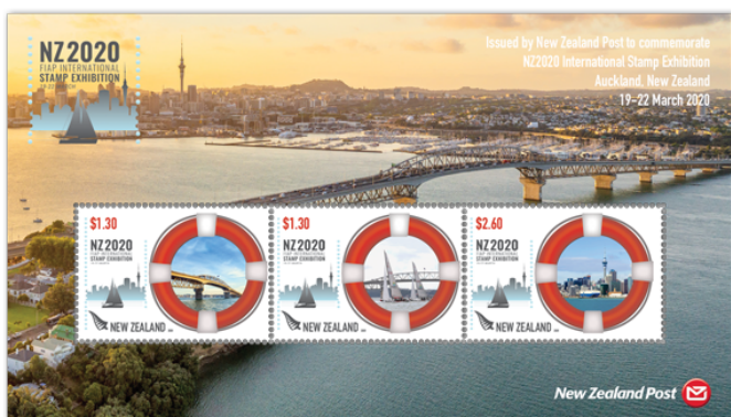
NZ 2020 – Welcome to Auckland